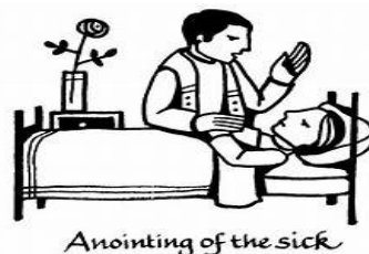
Anointing of the sick

"Whoever serves me must follow me, says the Lord; and where I am, there also will my servant be."