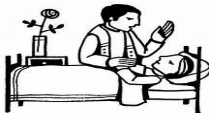
Anointing of the sick